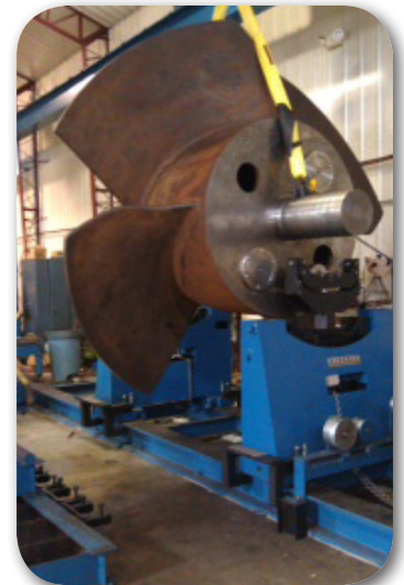
We perform vibration analysis on a wide range of components and assemblies - from sophisticated micro drives to industrial components that weigh thousands of pounds, such as this impeller. The impeller weighs 20,000 pounds and is 14 feet in diameter.

To learn more about our services, visit us online at http://hitekbalancing.com/ or call 978-840-9781 for even faster service.